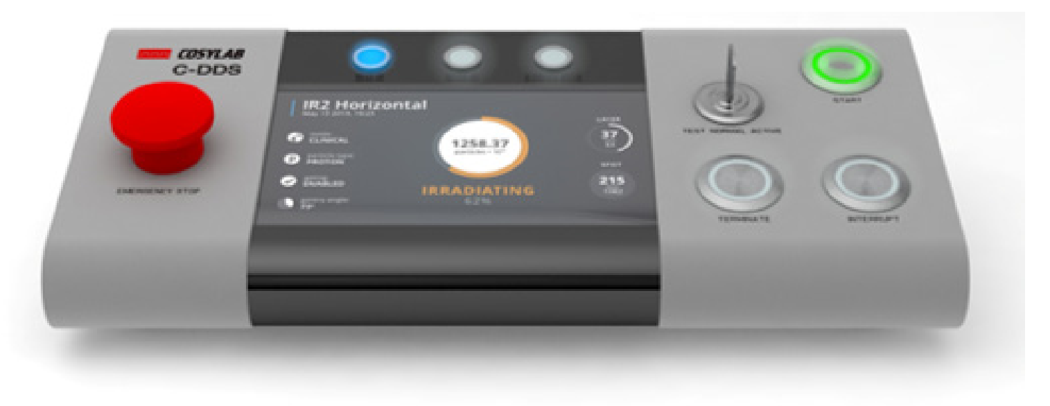
Fig. 2: C-DDS Treatment Control Panel

• Service Toolkit (Figure 3) software, allowing the users access to configurations, low-level data (status, logs, interlocks) and service functionality through a GUI.