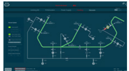
Example Cosylab WinCC OA GUIs